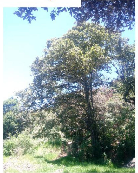
Ni tlaixkopinkayotl tlen kiinextiya auakuauitl noaxka.