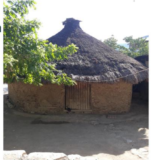
Ni tlaixkopinkayötl noaxka.

K ampa iuaya noteixmatkaua niistok, tlen a xkikaua ma tichajsi atl, tonati; santlenkena l imonkuatinij ya kena kineki atl uan i jkino axkana uakij uan yejyektsi xochiyoua