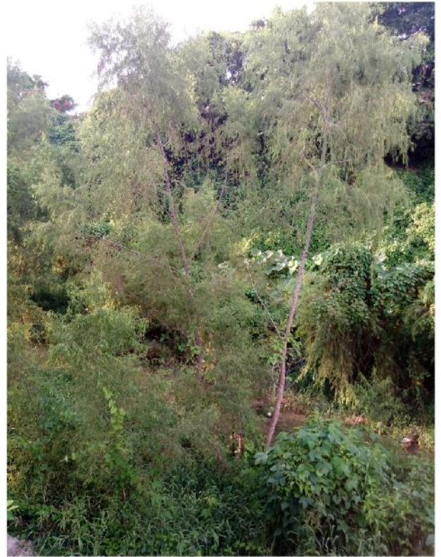
Ni tlaixkopinkayotl noaxka.

Tlali kampa nauatij, uan Onkayaya uexokuatinij ajatentli, kampa axalixtipa nojkia santlaueI Tlatotoniya ipan itlajkotipa mayo meestli yejka miyak tlapiyalmej san tonalmiki