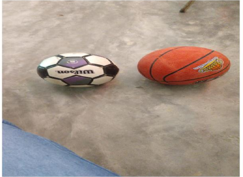
Ni tlaixkopinkayotl noaxka.