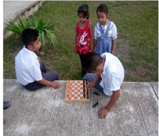
Ni tlaixkopinkayoltinij noaxka.