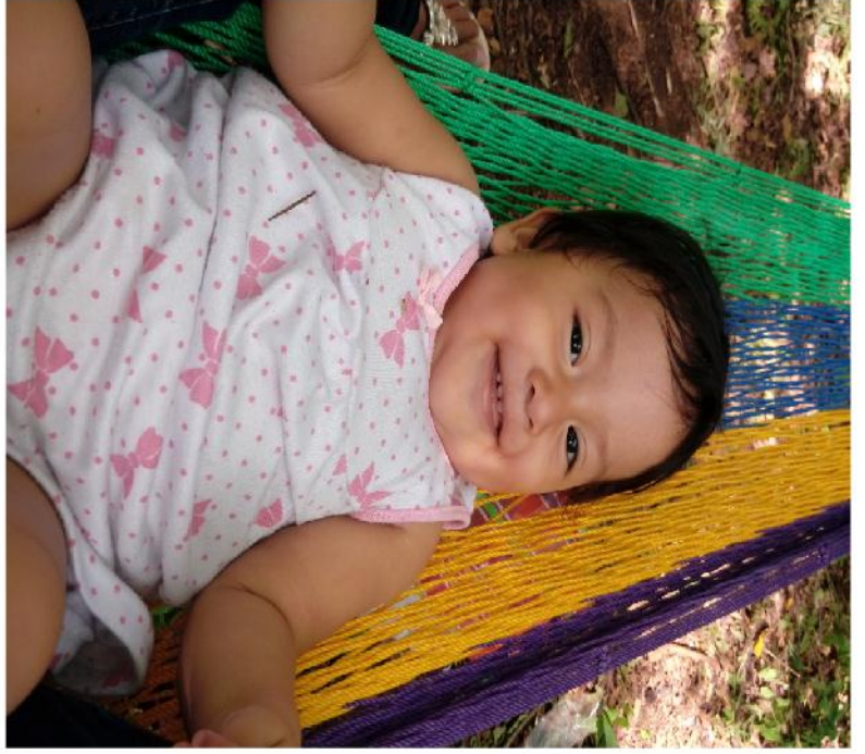
Ni tlaixkopinkayotl noaxka.

K onetsi o ui n ejnemi e jeliuis t omontinemi s an ken i uintiketl